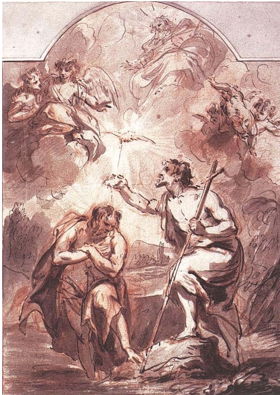
Baptism of Christ in the Jordan